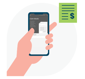
SEND YOUR INVOICES VIA THE APP